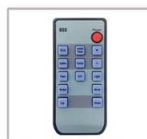
Remote Control All functions can be realized with it, making the operation much easier and convenient.