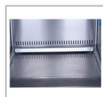
Work Zone Work zone is made of 304 stainless steel, is surrounded by negative pressure.