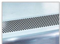
Anti-paper dust structure